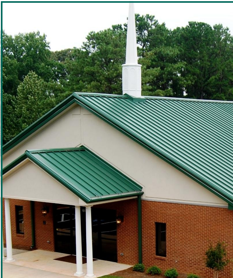
Bible Baptist Church of Marietta