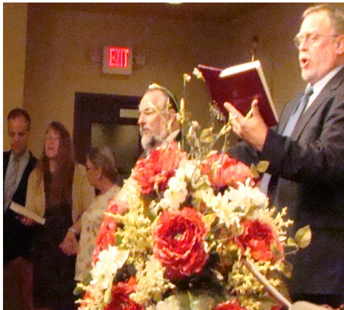
Influence Continued from page 6

Revival is what a sovereign God does for his local churches in bringing them to a renewed spiritual health that produces evangelism and produces missions.